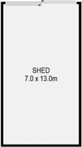
SHED (NOT TO SCALE)