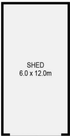
SHED (NOT TO SCALE)